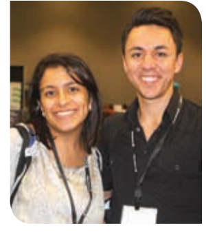
38TH ANNUAL CONFERENCE OCTOBER 16-19, 2014 • PASADENA

OCTOBER 16 PRE-CONFERENCE SESSIONS HILTON PASADENA & PASADENA CONVENTION CENTER