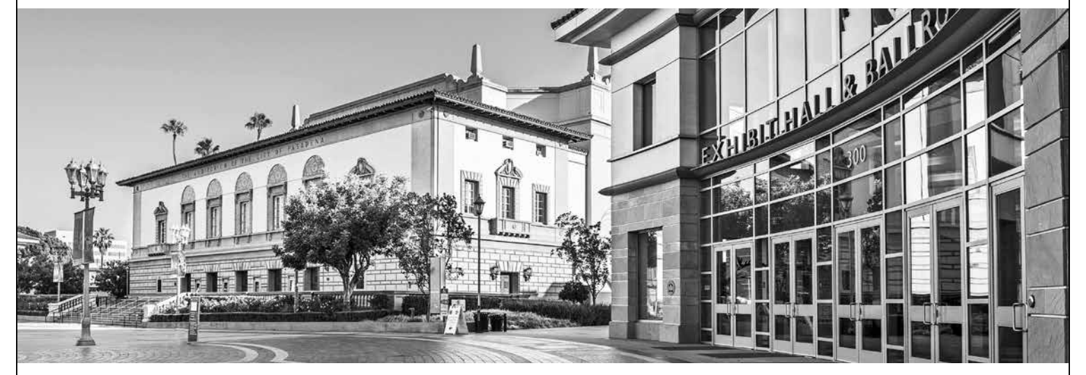
October 25-28, 2018 • Pasadena Hilton and Pasadena Convention Center