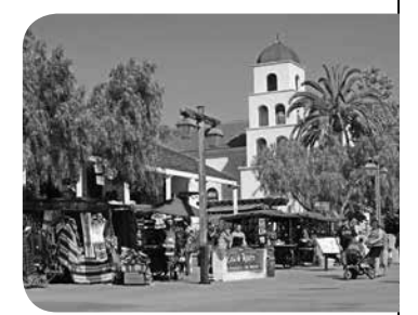
Free shuttle to Old Town San Diego