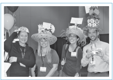
The Many Faces of Past Conferences